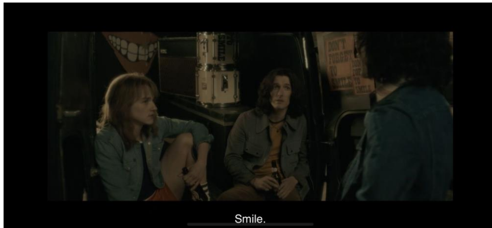
Picture 11. Freddie's first encounter with Brian and Roger

Intimacy is only represented by liking. This becomes the basis for a close friendship, unnoticed by passion and commitment. This can be seen in friendships that lack passion. Even when love appears, one of the parties will lose it soon.