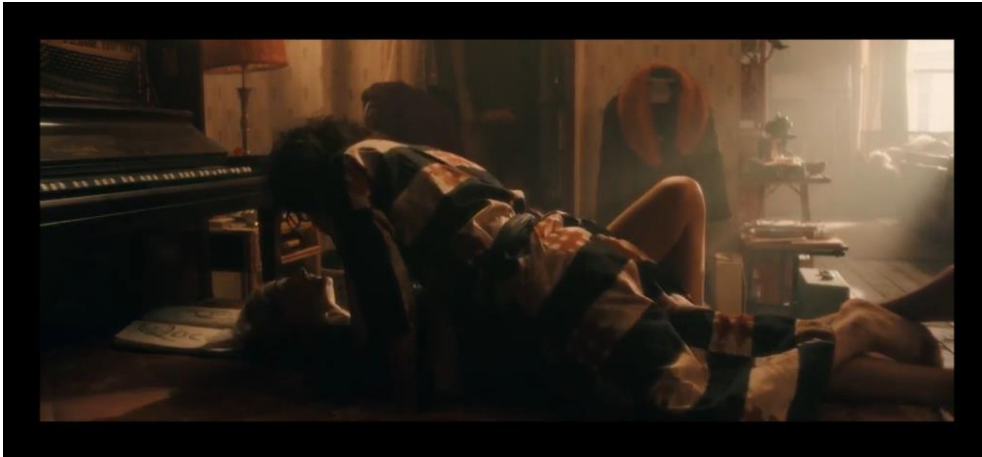
Picture 1. Freddie tries to have sex

The researchers use Freud Sigmund's personality theory. Researchers want to identify the personality of the main character in the film. Freud said that a person's personality is formed by the id, ego, and superego. The interactions and conflicts between these three components create personality.