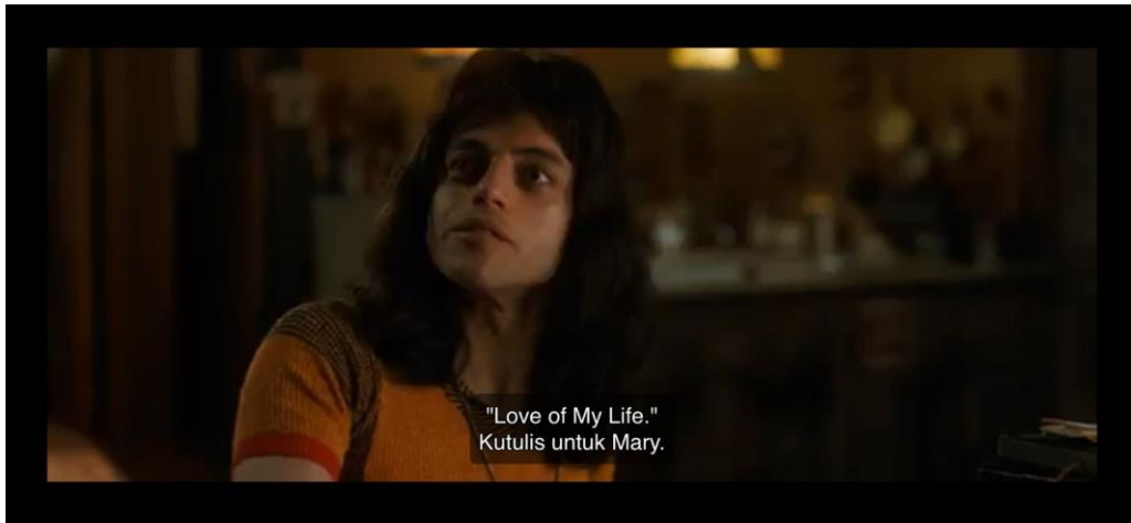
Picture 8. Freddie made a song for Mary