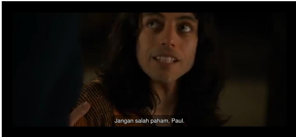
Picture 2. Freddie refuses to kiss