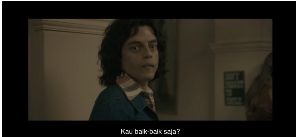
Picture 13. Freddie's first meeting with Mary

7:05-7:45, The scene begins with Freddie entering a building where there are students who have just finished watching a musical performance. Then Freddie started walking down the corridor until he saw a beautiful woman who was chatting with a friend. The woman's name was Mary Austyn. This was the first time Freddie met Mary. He looked at Mary for quite a long time as she walked down the aisle with a look in her eyes as if she was falling in love with someone at first sight. Then Mary realized that Freddie was watching her and started asking: