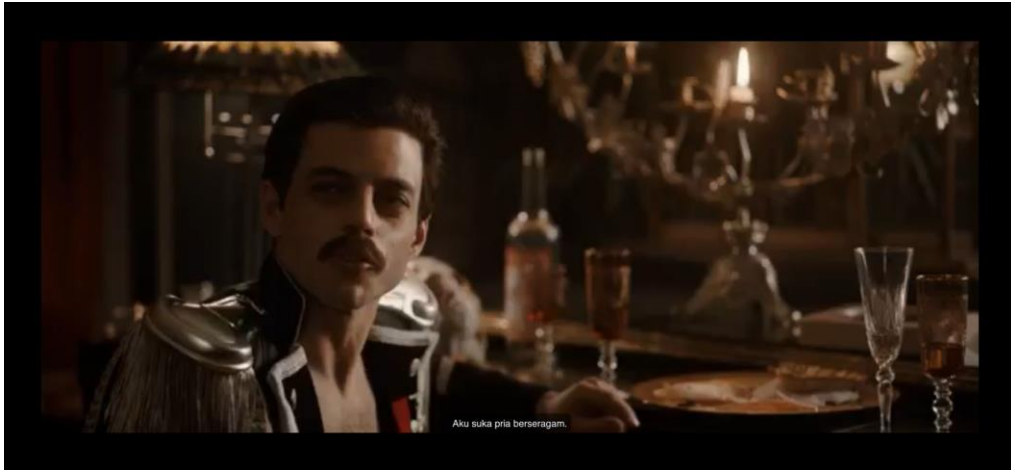
Picture 15. Freddie is interested in Jim

1:03:30-1:04:12, Freddie is a person who likes to throw parties so he doesn't feel lonely, Freddie is also an alcoholic. After the party was over, the servants were seen cleaning everything up. One of the servants was tidying up things near Freddie and Freddie tried to seduce the servant. However, the waiter was not happy with Freddie's treatment. The waiter felt uncomfortable and showed his anger towards Freddie. Freddie felt guilty when he found out that the waiter didn't like his actions. Then he apologized to the waiter and invited him to drink together. The waiter agreed to Freddie's invitation and then the two of them drank together. Freddie also said that the waiter had a handsome face, Freddie also said that he liked men with neat uniforms.