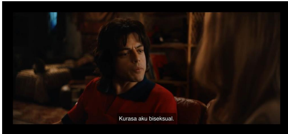
Picture 17. Freddie made a confession

53:20-54:30, Freddie was sitting alone with Mary watching replays of the concert. Here Freddie looks like he wants to say something to Mary. Then Mary realized this, she asked Freddie to tell the truth. At first Freddie seemed unable to say everything to Mary, he was afraid that his words would hurt Mary's feelings. But finally Freddie told everything and admitted that he was bisexual. Mary also looked sad when she heard this statement.