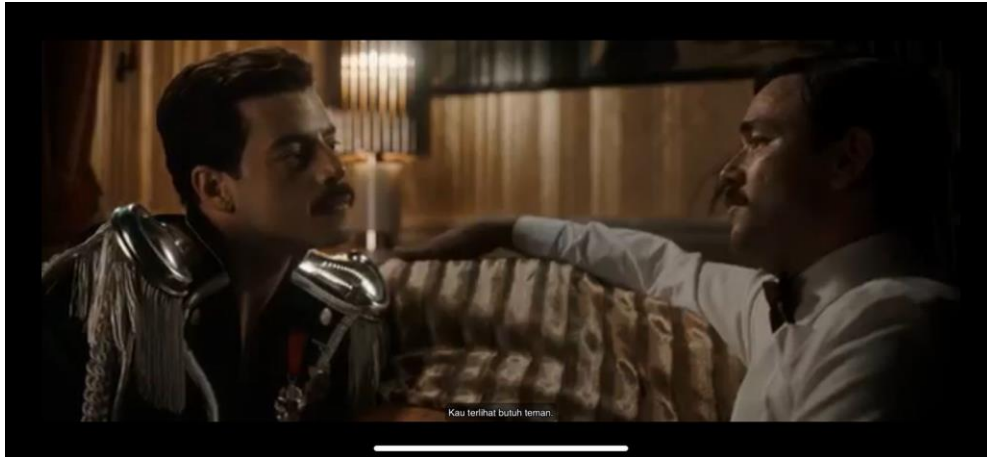
Picture 16. Freddie have conversation with Jim.

1:04:17-1:05:42, Freddie is seen talking to Jim and telling him his life story. Freddie said that he doesn't have many friends. Freddie told Jim all his sorrows, it seemed that Jim felt what Freddie felt. Then Jim tried to give Freddie a suggestion. Jim seems interested in Freddie. After that, this can be seen from the way he looks into Freddie's eyes. Then they kissed and Freddie seemed to like it. Jim was also seen giving Freddie a short message after they kissed.