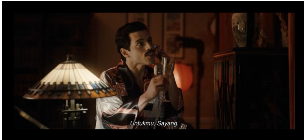
Picture 14. Freddie invites Mary for a drink

59:07-59:40, After being in a long relationship with Mary, Freddie's feelings for her never changed. Freddie will always love Mary even though he can't live with her now. But Freddie still wanted to feel close to Mary, so he had a house opposite Mary. Then, when he felt lonely, Freddie came to contact Mary and invited her to have fun. This time Freddie asked Mary to drink, but Mary felt something different about what he was doing. At first Mary refused Freddie's invitation, but Freddie slightly forced Mary to drink with him.