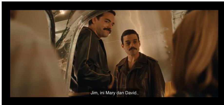
Picture 12. Freddie who introduced Jim to Mary

That was the beginning of their introduction and a new band would be formed which would later be known by many people. Freddie has also officially replaced Smile's vocalist and there will be additional personnel filling in on bass guitar.