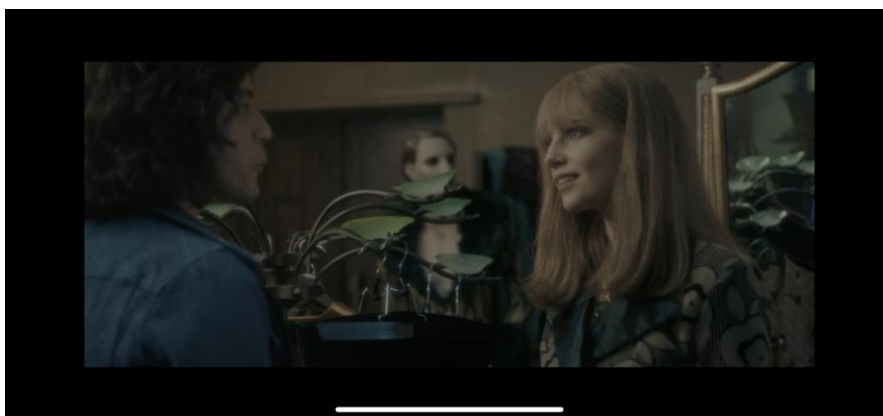
Picture 4. Freddie meets Mary at Biba

Couples prioritize each other's happiness over the opposite sex in a romantic relationship. This is because intimacy also includes feelings that indicate closeness, attachment and emotional ties to each other.