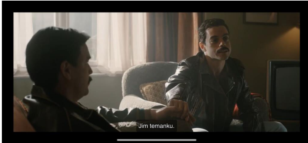
Picture 10. Freddie introduce Jim to his family

So great was Freddie's love for Mary that he dared to tell Mary honestly about everything. He also tries to defend his relationship with Mary, even though Mary is in a dilemma with the statement that Freddie made.