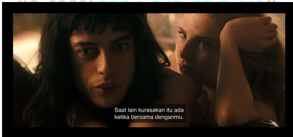
Picture 5. Freddie is telling Mary

Freddie felt like he wanted to always be close to Mary, it was proven that when he was with her, Freddie felt happy and happy. Freddie felt understood and supported in his desires when he was with Mary, he also felt appreciated when he was around Mary.