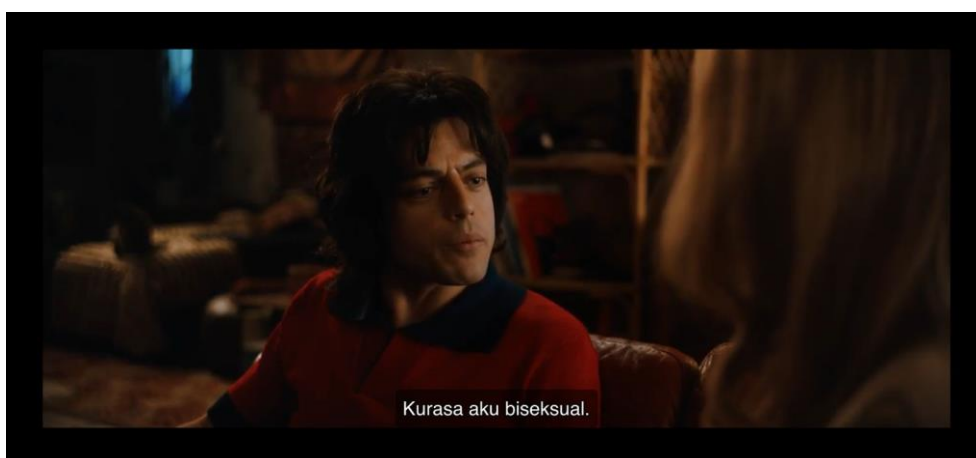
Picture 3. Freddie made a confession

Paul seemed unhappy with Freddie's statement that he wrote the song for Mary. Then Paul tried to kiss Freddie on the lips, but Freddie didn't like what Paul was doing. Freddie also said that Mary knew him very well and Freddie tried not to betray the trust given to her by Mary.