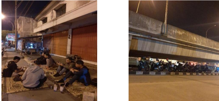
Picture 2. implementation of activities Kopdar Team Penting Hore ADV Solo

From the results of these interviews, it shows that there are similarities in the advantages of a relaxed discussion, namely regarding motorbike modifications and there are communication activities in groups that are carried out when attending kopdar events together by discussing and discussing what activities will be carried out in the future.