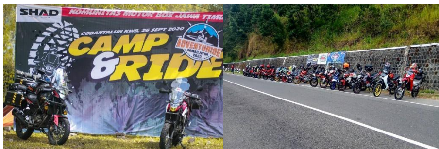
Picture 4. Activity Combined Tour With Team Penting Hore ADV Solo

From the expression of the president or team leader of Team Penting Hore ADV Solo, it can be seen that events in the Team Penting Hore ADV Solo community are very influential with the activeness of its members because the majority of members in this community really like long trips (Touring) or events with other communities..