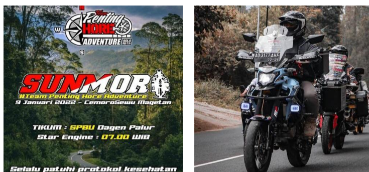
Picture 3 Activity Sunmori Team Penting Hore ADV Solo

From the results of interviews with the head of the Team Penting Hore ADV Solo, it can be seen that problems that occur are usually due to miscommunication between members and to respond to this the community leader will immediately find out the cause by approaching problematic members, namely by finding their closest friends who often chat in the community this and if it is known who it is, it will be immediately in private chat and ask and resolve these problems in person or online.