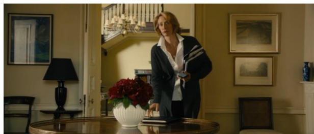
Picture 1. Attention of Mrs. Traynor to Will

Even though Will's parents were busy at work, they still paid attention to Will's condition and ensured Will was okay with his nurse. Will's parent's attention can be categorized as appreciation support.