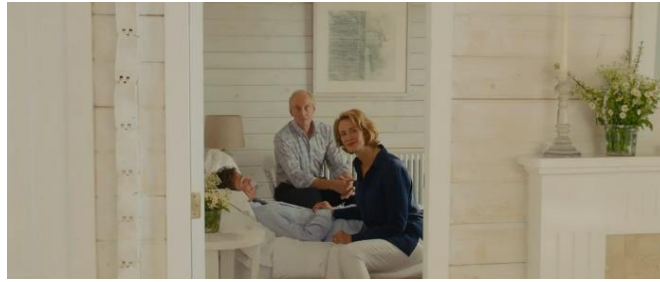
Picture 4. Will's Parent Accompanied Will in Swiss

This scene shows the emotional support when Will's parents accept Will's decision to commit assisted suicide to end his suffering. They took Will to Switzerland and accompanied him until Will's last time. They also let Louisa accompany Will knowing she is a precious girl for their son.