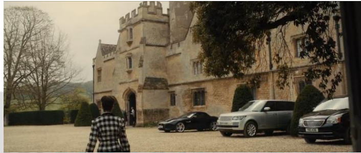
Picture 2. Traynor Family's House

in Buckinghamshire, England. This building was built in 1460 and is known as the Chenies Palace. This building has a long history as a Tudor Grade I listed building. Although it was never the seat of royalty, it did host royal visitors.