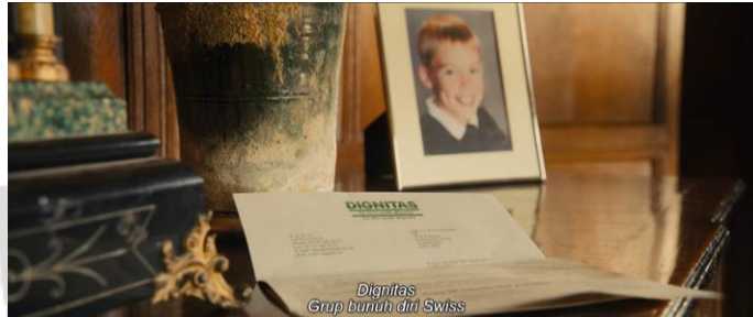
Picture 3. A letter from Dignitas, a Swiss suicide group to Will

Picture 4 shows a scene whereby Mrs. Traynor finds a letter from Switzerland regarding Will's registration for assisted suicide. The film shows Will registering in Dignitas, a Swiss suicide group. From the setting of place in this story, Will's family lives in England, more specifically at Pembroke Castle in Wales, United Kingdom.