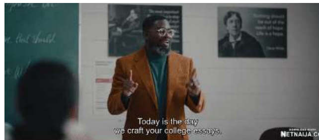
Picture 2. sense of inferiority

In Zach's state, he has a sense of inferiority caused by his growing and worsening pain that makes him unable to do things or achieve things like other people can. Zach's feelings are depicted in the scene below.