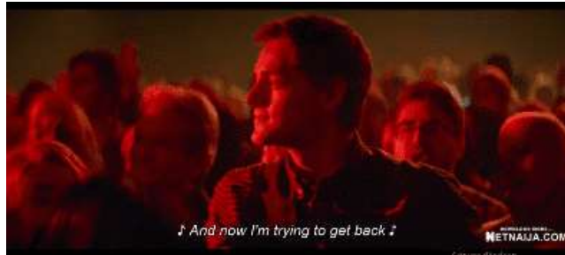
Picture 4. Sammy, Amy, and Zach saw Jason Mraz's concert

Seeing Jason Mraz's music concert was the starting point where Zach's dream as a musician emerged. At that time Sammy, Amy, and Zach saw Jason Mraz's concert in the metro, at that time Jason sang one of his very famous songs, I'm yours, at that time they were immersed in the excitement of the concert, all the audience enjoyed the concert that was going on, all the audience sang along with Jason's song. Zach, who was also immersed in the excitement of the concert, suddenly imagined that one day he would become a famous musician, compose many songs, perform concerts and all the audience sing his songs. This thought he expressed to Sammy.