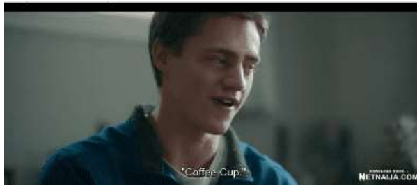
Picture 3. Zach has the inspiration

Striving for superiority appears when the individual feels weakness and physical inability to do something that causes feelings of inferiority to arise. The individual will start the effort for a better life on the basis of the strengths and struggles that arise from the shortcomings that an individual has experienced. Zach's superiority that appears in the film can be seen from several scenes below.