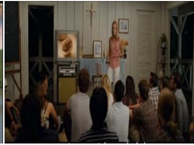
Medium Long Shot