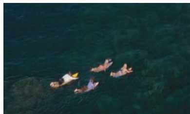
Extreme Long Shot