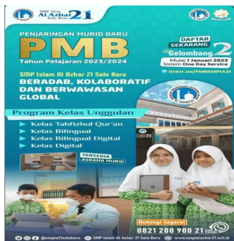
Picture 1. Brochure and Class Service Information for SMP Islam Al Azhar 21 Solo Baru

program is expected to provide added attraction to the community, especially parents and prospective students. Fig. 1 is a brochure and information on new student registration services for SMP Islam Al Azhar 21 Solo Baru.