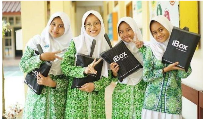
Picture 2. Documentation Unboxing and sharing iPad working with iBox