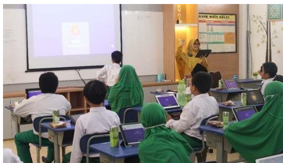
Picture 7. Using the Kahoot and Quizlet Apps