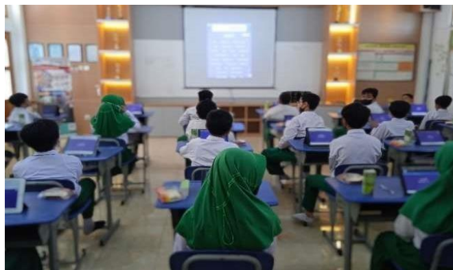
Picture 6. Digital Class Learning Documentation