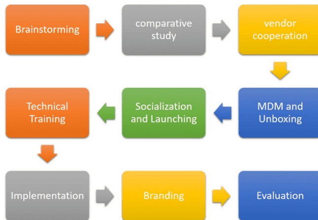
Picture 8. Stages of Digital Class Service Implementation