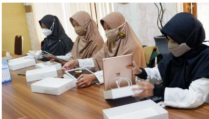
Picture 4. Documentation of the MDM Implementation process by the Digital Team Teacher

The next preparation is to conduct training on the use of digital classroom for teachers, see Fig 4. The training will be carried out by presenting the iBox to provide practical explanations on the basics of using the iPad, as not many teachers are used to using Apple-based devices. The materials discussed will be focused on maximizing the built-in features and applications of the iPad. Similar training will also be given to students in the early days of learning. The materials emphasized will be related to the main features of the iPad, namely the use of writing applications such as Notes, Pages, Keynotes, how to do multitasking with a split screen, functions and benefits of screen time, drag and drop, and several other basic tutorials.