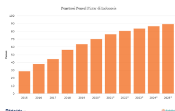
Figure 1. Smartphone User

Technological innovation in communication tools helps humans do things effectively and efficiently. The iPhone product has become an exceptional product compared to other technological products. Many companies are trying to compete with Apple companies today. Even the closest competitor companies, such as Samsung, are still trying to beat the level of sales and high brand image position compared to the iPhone. Human resources with a competitive advantage are characteristics of human resources that perform well. Employees with good performance in carrying out their duties and obligations will have a high sense of responsibility and dedication. To achieve good communication ethics in an organization or company is needed. Good communication can reduce the risk of misunderstanding or confusion in providing and conveying information. Some communication problems usually occur because communication within the company has not run optimally. After all, there are still obstacles to obtaining information from leaders to employees. The barrier is several channels that must be passed, such as information from leadership to the head of the section and then the employee.