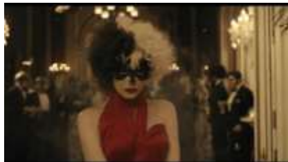
Picture 11. Estella turned into Cruella

They immediately put together their plan from the start. They find out when is the safest time to be able to steal the necklace also find out in detail where the CCTV cameras are installed until the day they plan to take place at the Baroness party. Estella even asked for help from one of her designer friends and an old friend who is now working in the field of journalism.