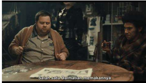
Picture 12. the stolen collar was accidentally swallowed

Cruella : "If you heard "no", it is. Now, the necklace.