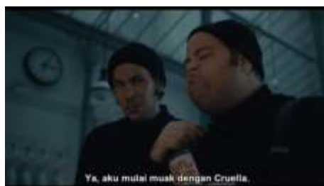
Picture 2. Cruella's lack of sensitivity

The following are pictures and conversations that show Cruella's lack of sensitivity: