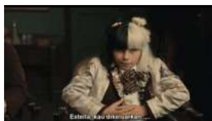
Picture 7. Cruella continues to carry out violent acts

The picture above explains that the points in the book are the number of how many Cruella has do rebel actions during school and it wasn't for a long time but in a short time. The points are getting more and more because Cruella continues to carry out violent acts of rebellion.