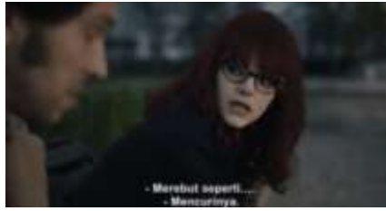
Picture 9. They immediately put together their plan

Estella : "I dropped the necklace as I was running away. She must've found it. It's mine. So, I'm taking it back."