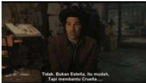
Picture 4. Jasper and Horace were talking

Jasper : "You know, we've all had bad things happen to us. me, him, you. But we've always been there for each other."