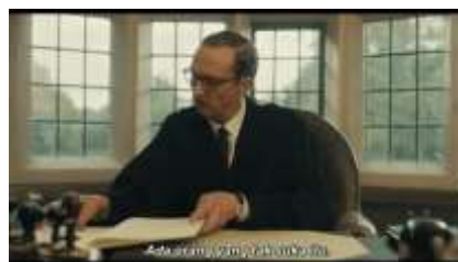
Picture 6. Cruella was mocked like a skunk

The picture above shows Cruella fighting with one of the boys at her school. It happened because Cruella was mocked like a skunk then shot a paper right in the face. The fight of course made Cruella have to meet the principal for fighting.