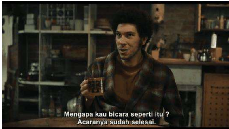
Picture 1. Cruella de Vil's ambitious

Cruella ended up with a high curiosity so that she grew into a woman who wants all her goals to be achieved by various things. Estella and Cruella are certainly different because Estella's ambition is in a positive direction while Cruella's ambition is in a cruel and evil direction because of her very high ambition for revenge. The following is evidence of Cruella de Vil's ambitious: