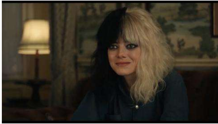
Picture 8. Cruella's return movement during the Baroness' big event