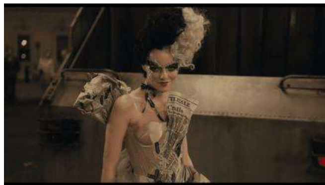
Picture 14. Cruella's actions when destroying the Baroness'

The following is evidence of the suitability of the pictures when the revenge action is carried out: